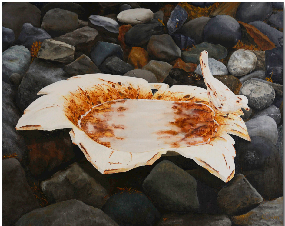
Figure 1: Birdbath , 20" x 16", oils on canvas

After high school, Cailin went on to study art (including drawing, painting, and graphic design) at Concordia University in Montreal, achieving a Bachelor of Fine Arts degree with a major in drawing.