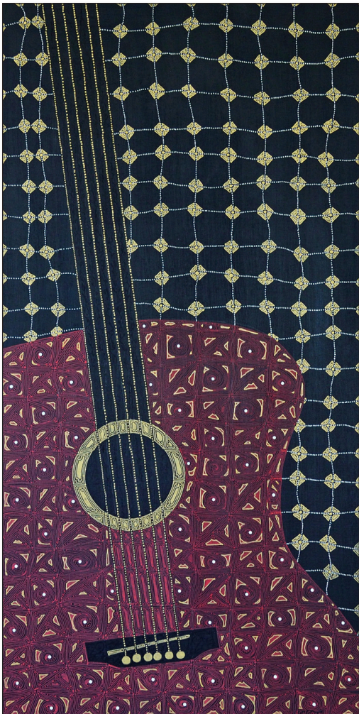
Figure 9: Red Guitar , 12" x 24", paint pen on birch board