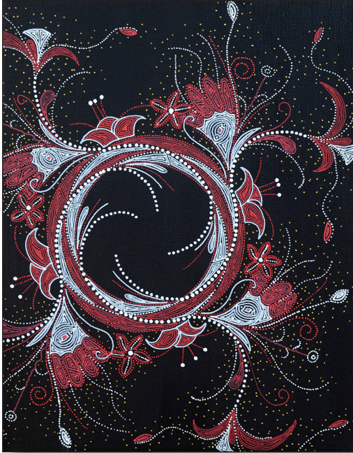
Figure 7: Floral Mandala , 8" x 10", paint pen, acrylic on canvas