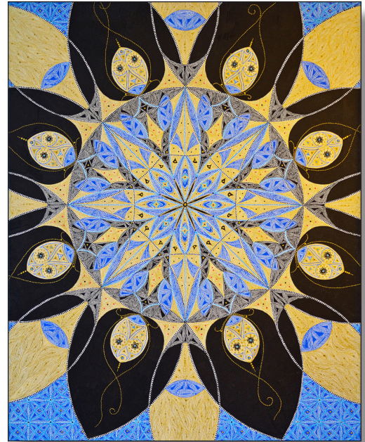
Figure 8: Large Mandala , 24" x 30", paint pen on canvas