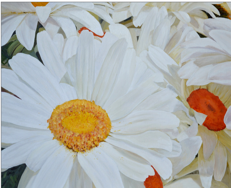
Figure 4: Daisies , 20" x 16", oils on canvas